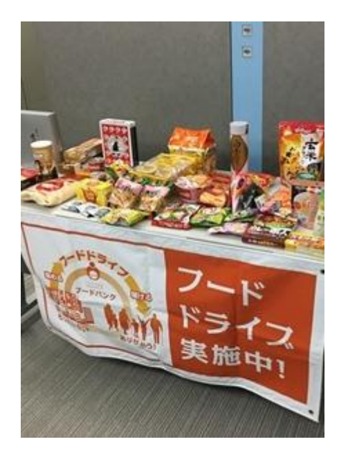
TFT Healthy Menu and donation box.