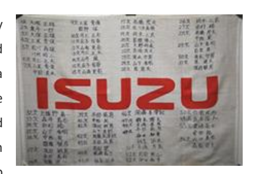
The flag with the names of all Isuzu team members since the first expedition. It is standing in the Showa station.

The Japanese Showa Station in Antarctica has been part of many achievements including the detection of the ozone hole in 1982, and global warming monitoring is currently being carried out there via a large atmospheric radar. Isuzu has contributed technology through the maintenance of our snow vehicles and engines (for both vehicles and power generators) that are used in this harsh natural environment. In this way we support the lives of the members stationed there and help with their work.