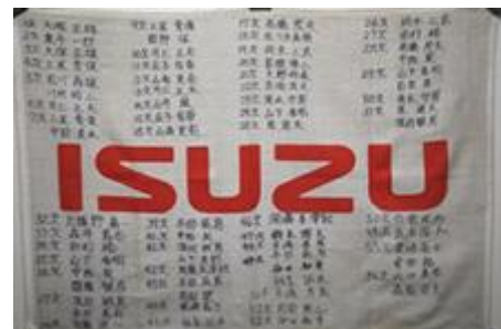
The flag with the names of all Isuzu team members since the first expedition. It is standing in the Showa station.

The Japanese Showa Station in Antarctica has been part of many achievements including the detection of the ozone hole in 1982, and global warming monitoring is currently being carried out there via a large atmospheric radar. Isuzu has contributed technology through the maintenance of our snow vehicles and engines (for both vehicles and power generators) that are used in this harsh natural environment. In this way we support the lives of the members stationed there and help with their work.