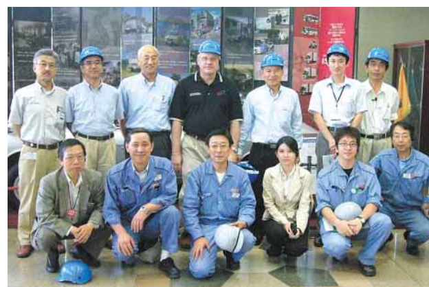
Consolidated Environmental Meetings of Overseas Group

Isuzu and six overseas group companies held a second global plant environmental meeting in Japan in June 2007. They launched environmental efforts that reflect the regulatory circumstances of individual countries, including Thailand, the United States and European countries, by setting medium- and long-term goals, such as the prevention of global warming. In addition, the members toured the Fujisawa Plant, a main Isuzu plant, to observe the production process and environmental equipment as part of the information-sharing efforts.