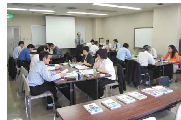
In-house auditor training session

ISO 14001 in-house auditor training sessions were held to train environment management members who play key roles in promoting environment-related activities at dealers' sites. A total of 62 trainees joined the training and all of them qualified as in-house environmental auditors. Training sessions are also planned in fiscal 2007 for the nurturing of environment management members.