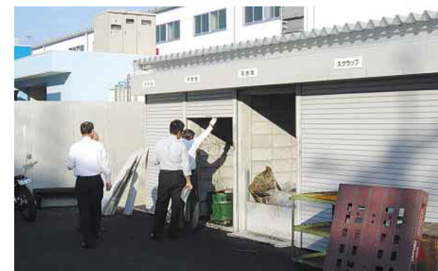
A scene from an audit