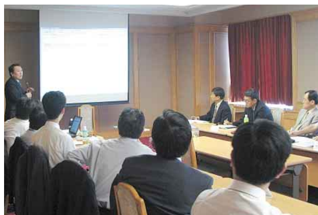
Domestic consolidated group meeting

Isuzu and its domestic group companies plan to reduce environmental impact by setting goals for the group for 2010, while maintaining their individuality and sound pace of progress. The group companies take turns in sponsoring plant environmental meetings on a regular basis, to improve the quality of their efforts through litokodori activities. In October 2006, the Award of the Minister of the Environment was achieved by the Isuzu Engine Manufacturing Hokkaido Corporation for industrial waste zero-emission activities (see p. 39).