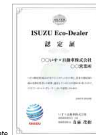
Silver Eco-Dealer Certificate