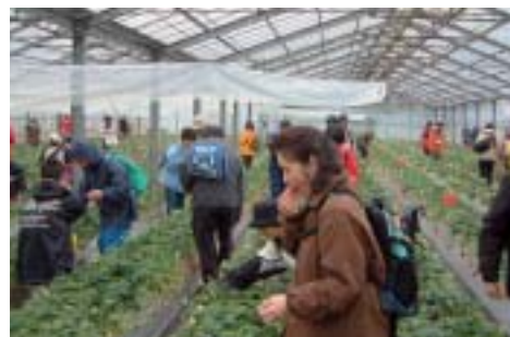
Picking strawberries in hiking tour in March 2003