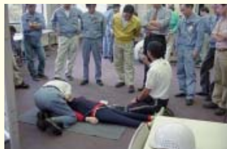
Drill at USE21 first-aid class

The Accident Prevention Subgroup offers a variety of educational programs with lectures and drills, including first-aid lectures, safe-driving lectures and training sessions for risk prediction. These activities are making significant contributions to the prevention of industrial accidents and also to help newly recruited employees adapt to the workplace. Activities of the USE21 group include nurturing many first-aid instructors and staff. Aiming at enhancing first-aid skills and awareness, group members have every year participated in a first-aid competition sponsored by Kanagawa Prefecture, with high-rank prize winners turning out in great numbers.