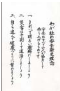
Isuzu's safety and health philosophy

Isuzu aims to make its workplaces accident-free, safe and pleasant. Our philosophy is that "Safety Depends on Everyone's Cooperation". Our focus is accident prevention, and we promote three themes to personnel: "Preventing Industrial Accidents, Traffic Accidents and Fires", "Improve the Work Environment" and "Promote Health." We pay particular attention to safety to prevent industrial accidents based on the case studies of accidents.