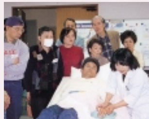
"From Morning to Bedtime" Caregiving Seminar