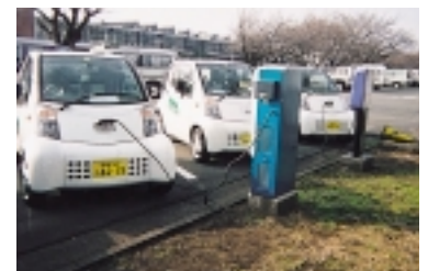
Electric vehicle parking and charging equipment

Isuzu participated in a transportation flow experiment, proposed by the government of Fujisawa City to help find ways to reduce traffic congestion and conserve energy. Its objectives were to lessen traffic jams by smoothing flows and motivating vehicle users to take public transportation. It included three experiments: park-and-ride, car-sharing, and ride-sharing. Isuzu provided five passenger cars at no charge for ride-sharing, and installed parking and charging equipment for three electric vehicles. Some employees also participated in the testing.