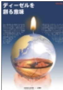
"Why We Make Diesel Engines"

Isuzu is actively providing its employees basic training on environmental issues and Isuzu's environmental efforts in order to increase their awareness and motivation for action. The training is provided on many occasions, including when employees join the company and later are promoted, and at various levels in the organization. In addition, all employees receive special training on environmental management systems, and in-house courses are available to selected employees of the 44 companies that have their workers at Isuzu plants. Our company newsletter, the "Isuzu Shimbun," carries a special report on the year's environmental activities, in the environment month edition each June. In fiscal 2001, the newsletter began a series of articles entitled "A Look at World of Diesel Engines," in order to promote the proper understanding of diesel engines among employees let them know about how diesel engines are at work overseas, including Antarctica. In fiscal 2002, we launched the "Spirit-Up Campaign" to encourage the active involvement of all employees in environmental activities. To boost employee awareness, we created "Why We Make Diesel Engines" posters that explain the advantages of diesel engines, the core of Isuzu's business, from the viewpoint of the global environment.