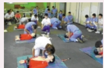
USE21 first-aid class

Workers of the product development department have organized the USE21 voluntary working group and are actively working in different subgroups. The Fire Prevention Subgroup holds first-aid lectures and drills at the Disaster Prevention Center. The Traffic Safety Subgroup holds safe-driving lectures. The Industrial Accident Prevention Subgroup offers a variety of educational programs with lectures and drills, including vehicle crash tests and trainings for risk-prediction. These activities are making significant contributions to the prevention of industrial accidents and also to help newly recruited employees adapt to the workplace.