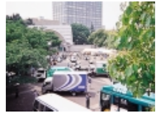
Eco-Car World exhibit