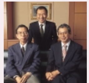
Eco Planning Group, Public Relations Department

It is our corporate commitment to make further efforts toward a sustainable society, by seeking to further reduce the environmental impacts of diesel engines, which we believe have the potential to achieve even greater environmental performance. We value your comments and suggestions, and will use them to help us continue evolving as a company.