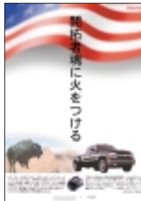
"Firing Up the Pioneer Spirit"