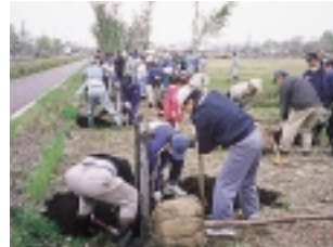
Tomakomai City Tree Planting Festival

Isuzu is cooperating with local tree-planting programs, to promote its involvement in local communities. In May 2001, the Hokkai Plant participated in the Tomakomai City Tree Planting Festival and planted 60 tall 15-year-old cherry trees in Nishiki Onuma Park. In the same year, 50,000 trees and shrubs were planted on 400,000 square meters at the Hokkaido Plant, to absorb carbon dioxide and promote local greenery.