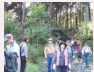
Hiking at Hakone in September 2001