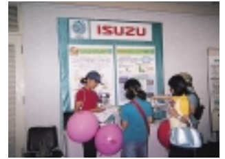
Environmental Fair of Fujisawa City