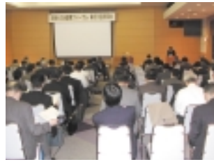
Natural Gas Vehicle Forum

Isuzu sponsors various environmental seminars and lectures, and provides speakers, for our customers, suppliers, media, the public and students of elementary, middle and high schools. We also welcome interviewers and others seeking information, and participate in a range of events and exhibitions. In March 2002, the thirty-third assembly of the Natural Gas Vehicle Forum, sponsored by the Japan Natural Gas Association, was held at the Isuzu Headquarters with the participation of 200 people.